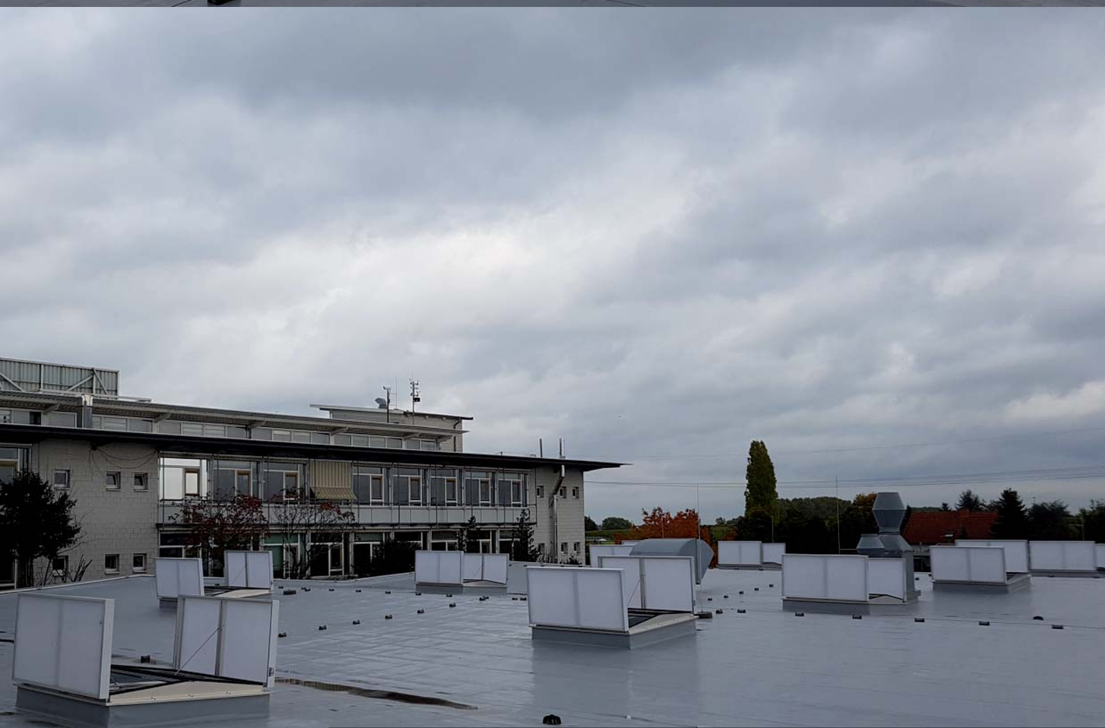
Smaller light domes were replaced by custom-made PHOENIX systems as well.