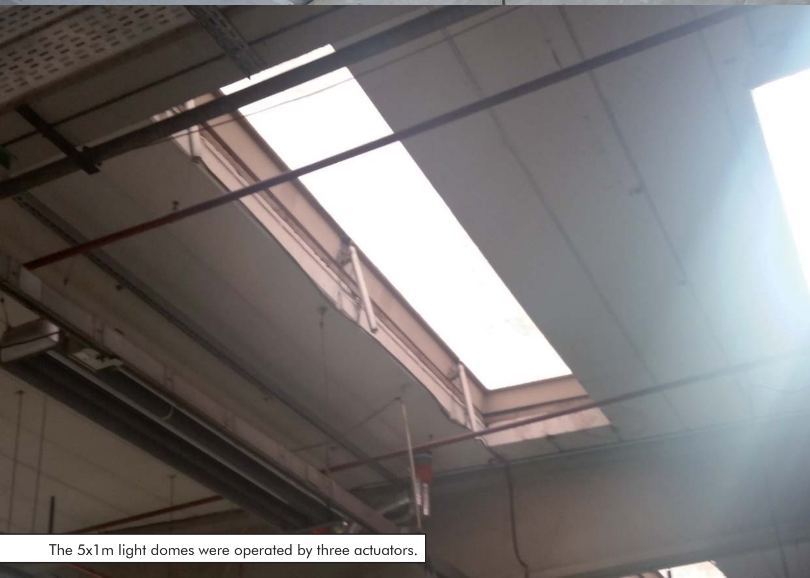
The 5x1 m light domes were operated by three actuators.