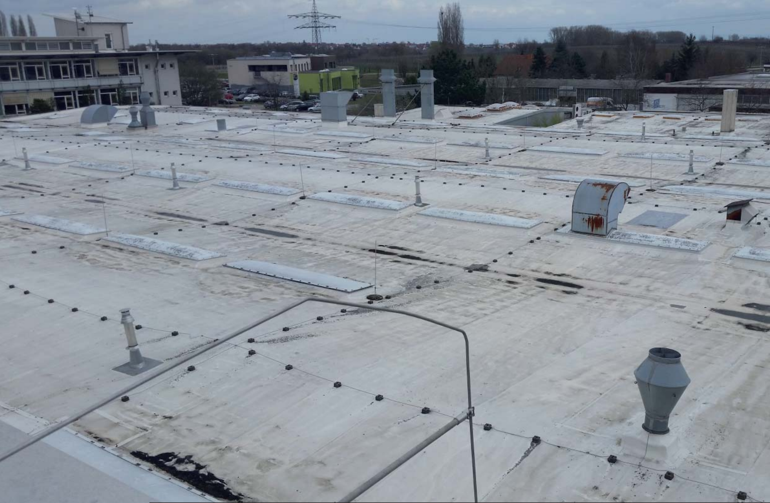
Many of the old light domes were useless for ventilation as they couldn't be opened any more.