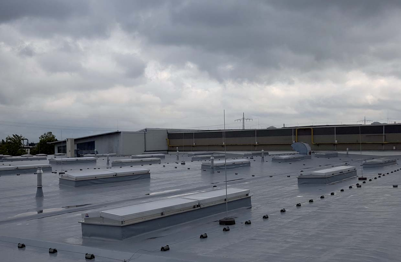
One rigid system and one serving as smoke and heat ventilation unit each were installed on the plinths.