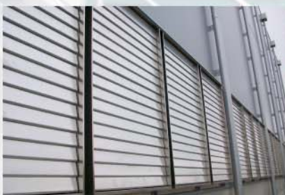
Overlapping louvres in an AIRJET