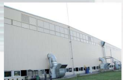
AIRJET mounted in a wall