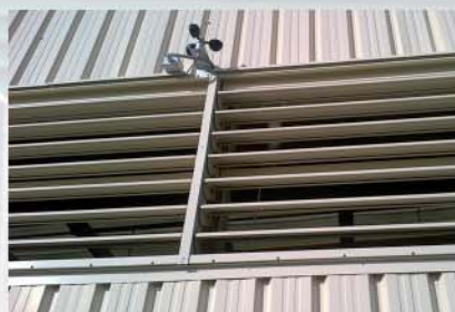
AIRJET closes by strong winds